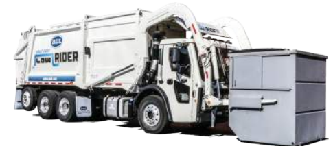
Optimized Weight Low Rider body package