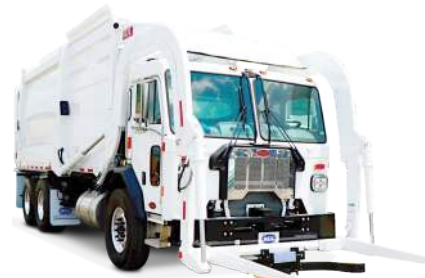
Available with Curotto-Can commercial grabbers