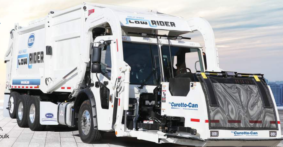
Shown with optional Half/Pack Low Rider® Body and Curotto-Can® Residential Package

* Heil does not provide tax advice. Please consult your tax advisor regarding the specific tax implications of your selected product.