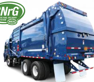
Available with optional CNRG® Tailgate