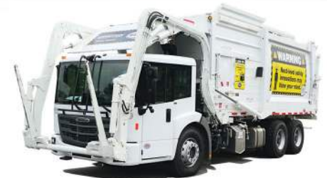
Available with articulating arms for EonicSD™ chassis