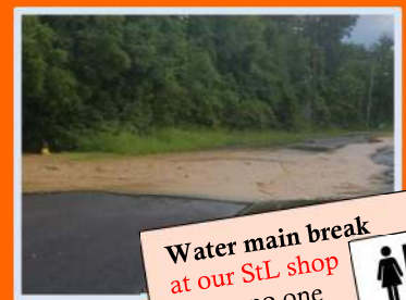
Water main break at our StL shop - hope no one needed to flush!