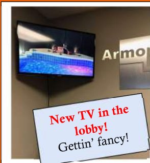
New TV in the lobby! Gettin' fancy!