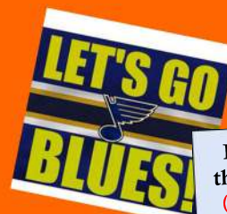
BLUES WON the Stanley Cup! (Did ya hear?!)

Armor will be Closed on Monday, Sept 2 nd for Labor Day!