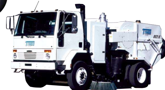
A patented Self-Contained Multiple Filtration System enhances the Regenerative Air System, allowing the DST-6 to keep cleaning Wet or Dry!

TYMCO REGENERATIVE AIR SWEEPERS Rejuvenate the Environment -- AQMD Rule 1186 Certified PM 10 - Efficient