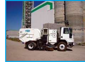
It's equally efficient cleaning in and around cement applications.