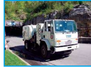
The DST-6 delivers superior performance above ground, in mining and storage applications...