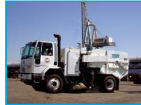
TYMCO's Model DST-6 is at home cleaning America's port facilities...