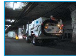
And in underground applications, where clean air is essential.