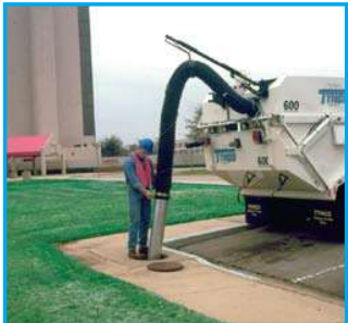
The DST-6 can be equipped with TYMCO's powerful Auxiliary Hand Hose option, allowing easy clean-up of those hard to reach applications such as catch basins and around garbage containers and compactors. The powerful suction power enables you to clean catch basins up to 20 feet deep. Controls are located at the rear of the sweeper for greater operator safety.