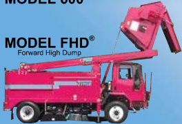
MODEL FHD® Forward High Dump

FOR MORE INFORMATION CALL 1-800-258-9626 www.tymco.com