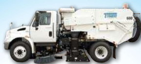
MODEL 600® Conventional Cab Chassis