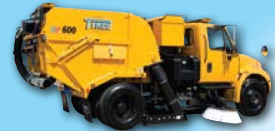
MODEL HSP® High Speed Performance for Airport Runways

Specifications subject to change without notice.