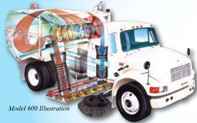
Model 600 Illustration

We want you to understand the Regenerative Air System and your TYMCO sweeper completely, so you can get optimal performance from your equipment investment. That's why, for more than twenty-five years, we've offered two-day scheduled training schools at our facility in Waco, Texas. Owners, managers, operators and mechanics get hands-on training and answers to specific questions. Enrollment levels are kept low, so you and your team will get personal attention as well as the opportunity to learn from the experiences of other attendees through the interaction of the class.