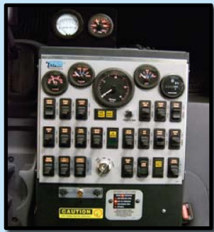
Operator friendly Sweeper Control Panel illuminates for easy night vision.

Heavy-duty Isuzu 17,950 lb. GVW chassis can be equipped with optional dual steering.