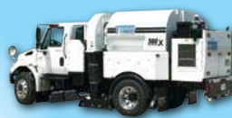
MODEL 500x® High Side Dump